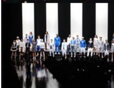
RTW SPRING/SUMMER 2010