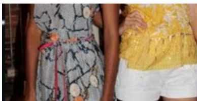
LEIFSDOTTIR SPRING 2010